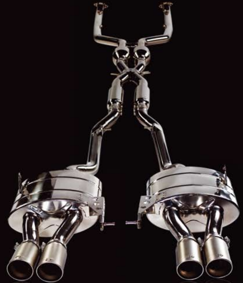
BMW M3 Evolution system

Hard facts: Titanium, 24 HP plus, 35 Nm plus, 23 kg minus