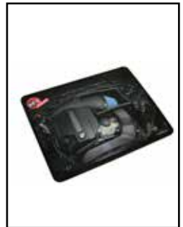
aFe Mouse Pad