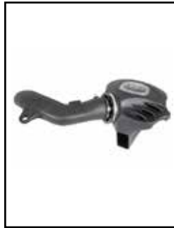
Pro 5R Intake System