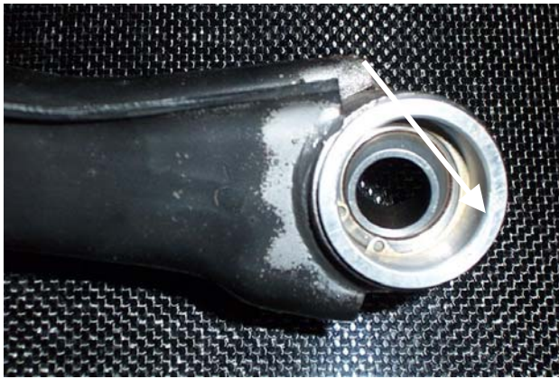
Figure 1 E36 Passenger side arm